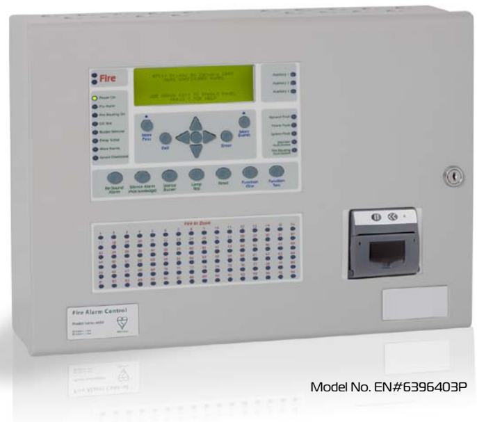
Model No. EN#6396403P